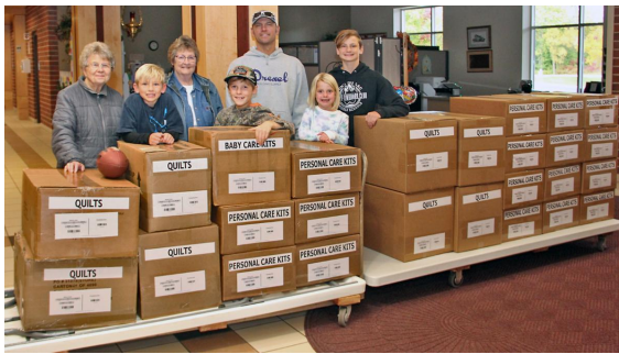
A full load of boxes for Lutheran World Relief

More info to come in the December newsletter!