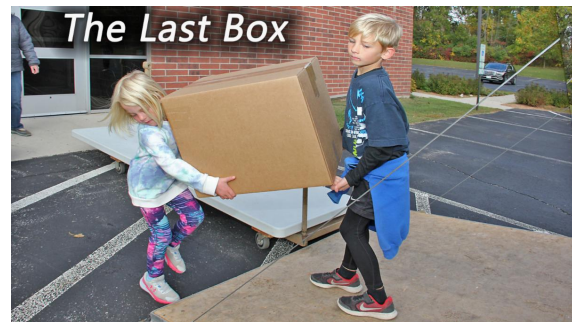
Thank you to our helpers who loaded them all up!