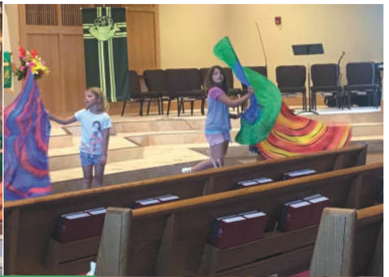
I-T Family Worshiping Together